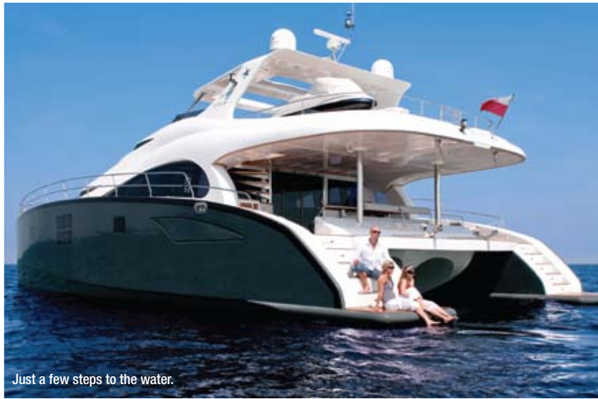
Just a few steps to the water.

The handrails are kept discreetly to a minimum without compromising passenger balance and safety. The preferred cruising position for many would have to be on one of the bows, so you can delight in how the boat