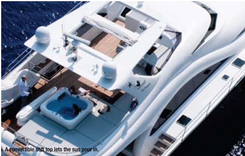
A convertible soft top lets the sun pour in.