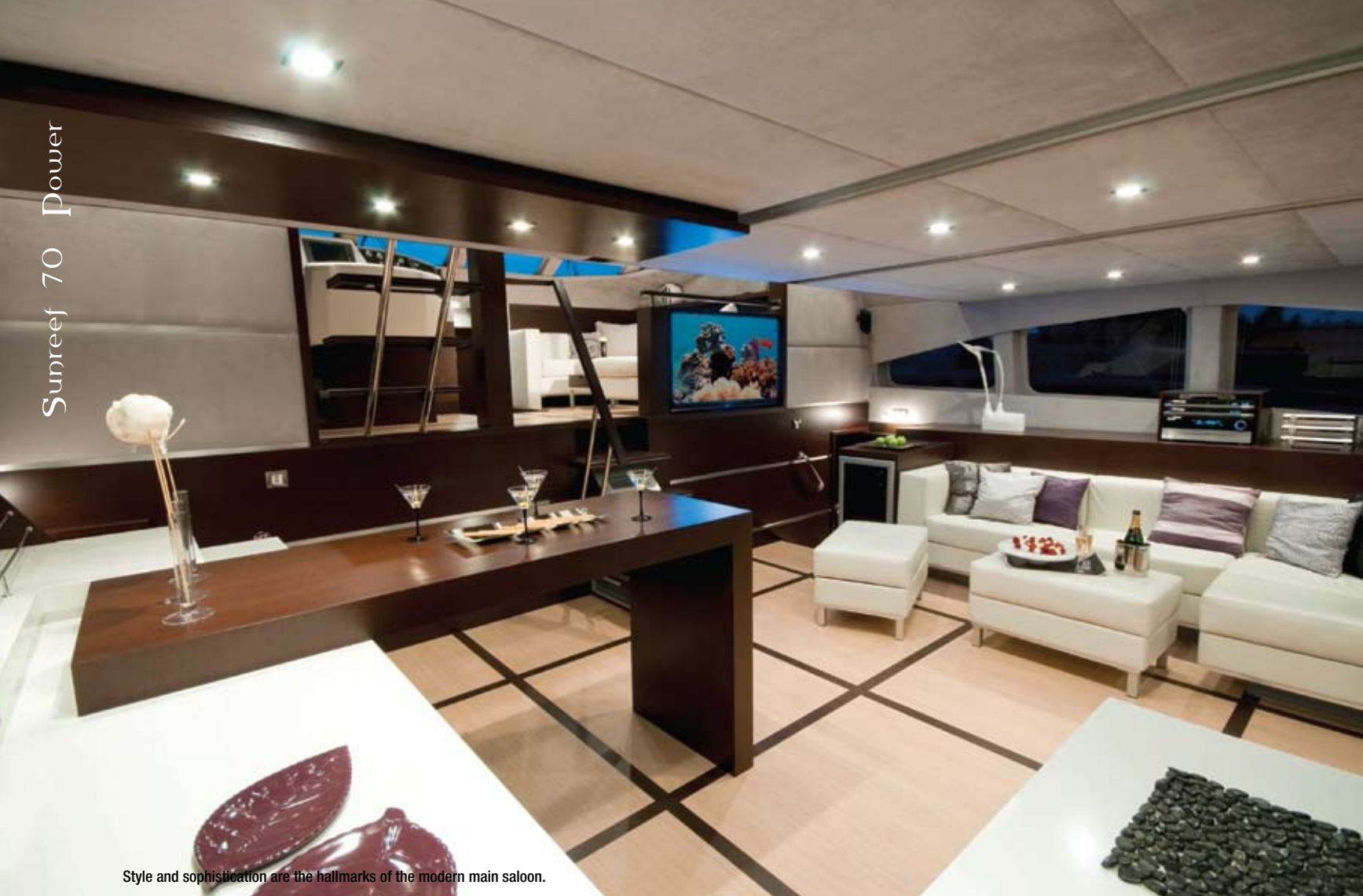
Style and sophistication are the hallmarks of the modern main saloon.

In its relatively short existence, Sunreef Yachts has carved out a solid reputation for producing quality sailing catamarans, with over 40 now delivered and sailing in a variety of locations around the globe. Since receiving a commission by world-renowned Swiss sailor, Laurent Bourgnon, the yard has also moved into producing luxury power catamarans. Bourgnon's requirement was for a vessel suitable to take his young family on an around-the-world odyssey, so the specification was for a practical and economical boat specifically modified to handle long distance, transoceanic crossings. Sunreef worked closely with Bourgnon to develop JAMBO , a yacht capable of an incredible 20,000-nautical-mile range at a steady cruising speed of eight knots. Now the company has taken what it has learnt to produce the Sunreef 70 Power.