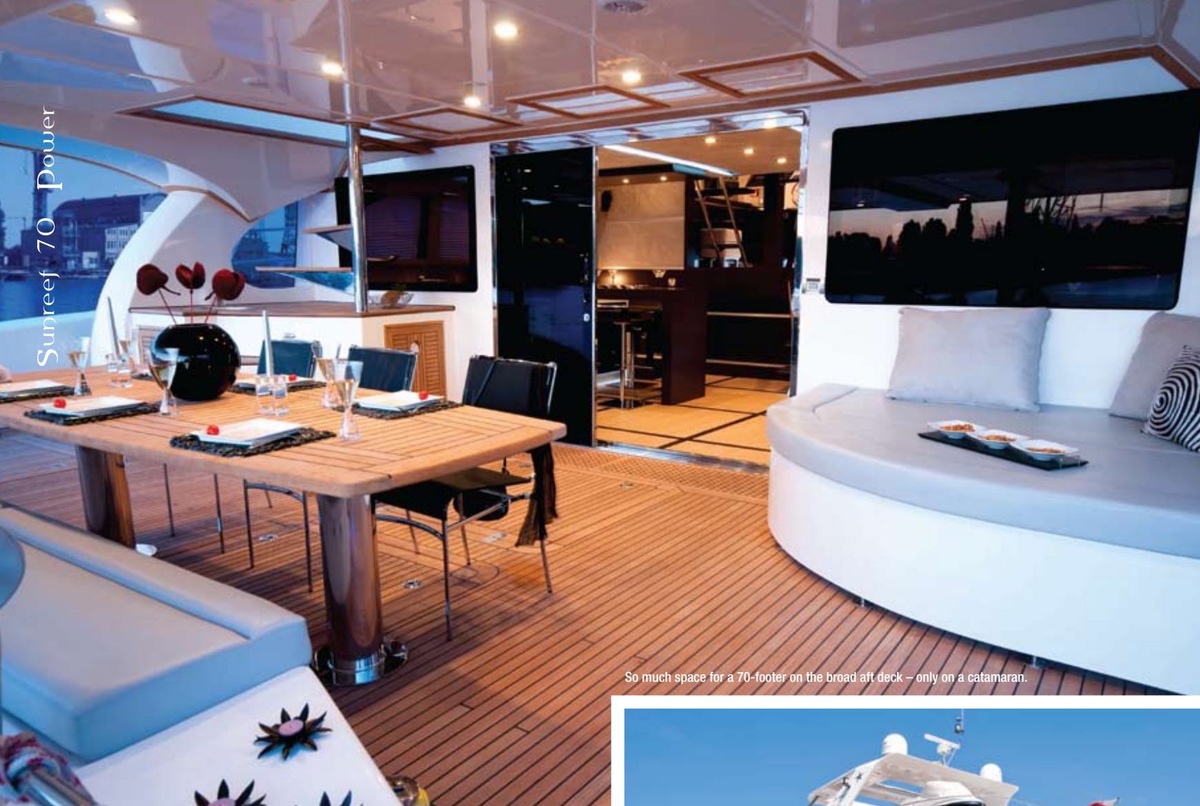
So much space for a 70-footer on the broad aft deck – only on a catamaran.

These are only minor nuisances that can be easily remedied given Sea Bass is only the third hull of this model type to be produced. Visibility from the inside main helmstation could be improved with slightly larger front windows on both sides.