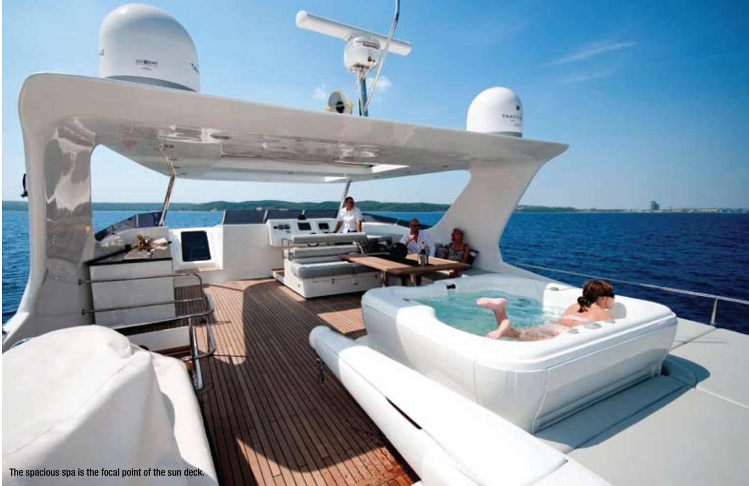
The spacious spa is the focal point of the sun deck.

ploughs though the water so swiftly, elegantly slicing the crests of the waves as you power on to your destination.