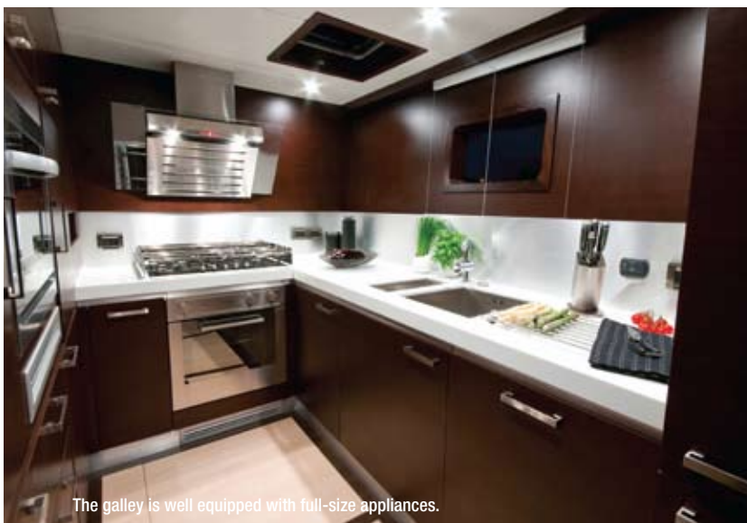
The galley is well equipped with full-size appliances.