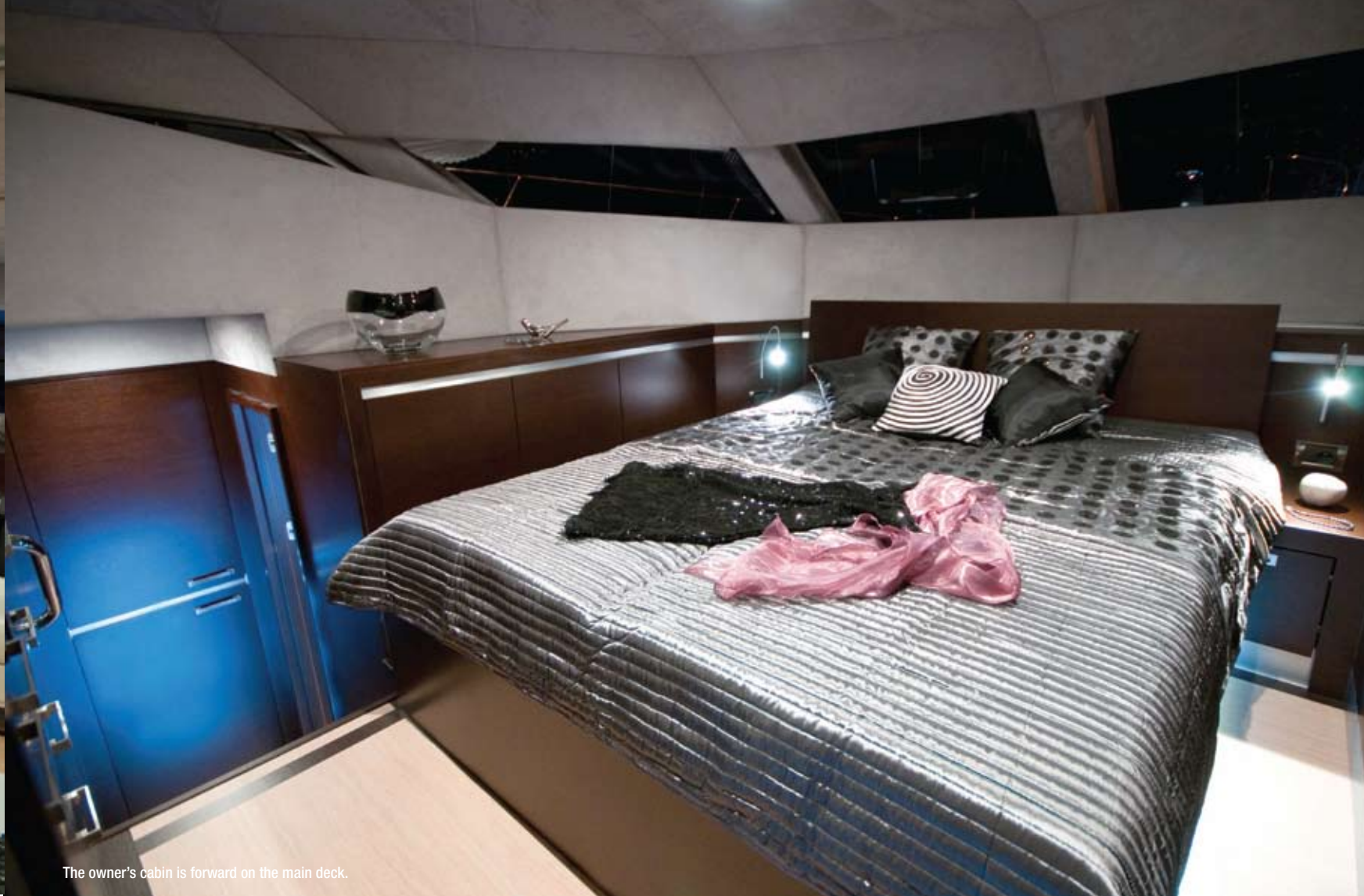
The owner's cabin is forward on the main deck.

The large saloon is ideal for entertaining and a fully integrated, state-of-the-art stereo system pipes music throughout the boat to create an ambiance to match any occasion or mood. There's also a video system with multiple plasma/LCD monitors for a relaxing night in front of a movie. Opening the wide glass doors aft of the saloon creates a seamless, open-plan space perfect for alfresco dining and comfortably seating eight guests.